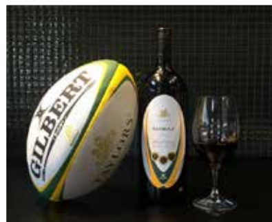
A1 Multi-Color AUS Taylors rugby soft touch