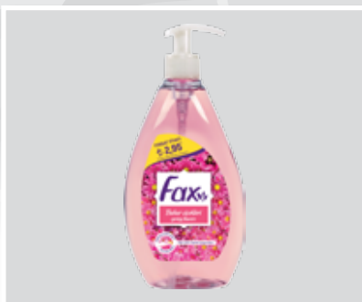
B1 DGS  ax sivi sabun