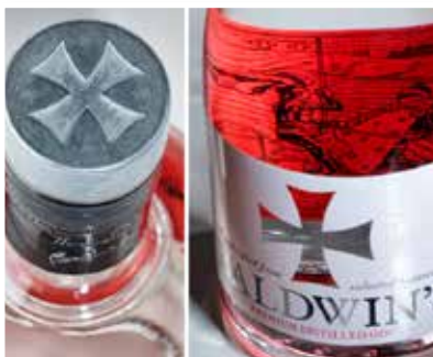
A2 Reynders Baldwin's Gin