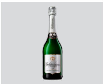
A1 GEWA Geldermann Classique sec