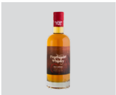
A2 Marzek Heathland Whisky