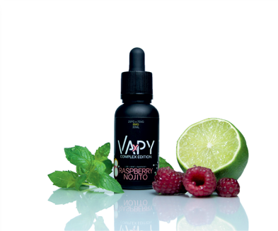
A15 KDS Va+Py