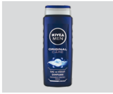
A9 Doga Nivea Original Care