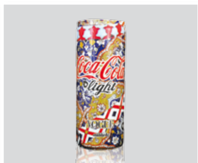
C3 Doga Coca Cola Vogue