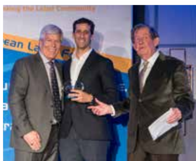
IPE Group C