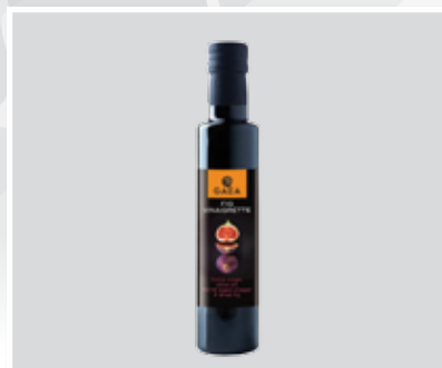
B2 Cabas GAEA FIG Dressing