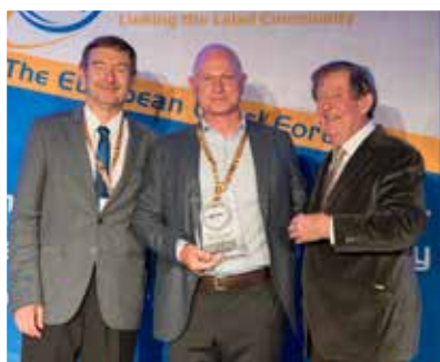
Royston Labels BIS