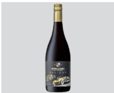
A1 Multi-Color AUS Bagtown Keith the Showman Pinot Noir