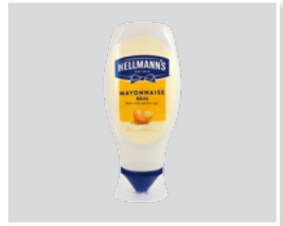
A4 Doga Hellmann's Mayonnaise