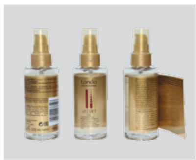
B4 schaefer Londa VelvetOil