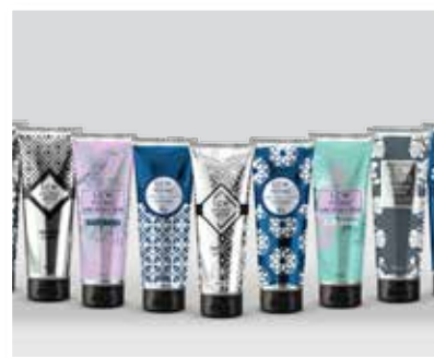
C1  iftsan LCW Home