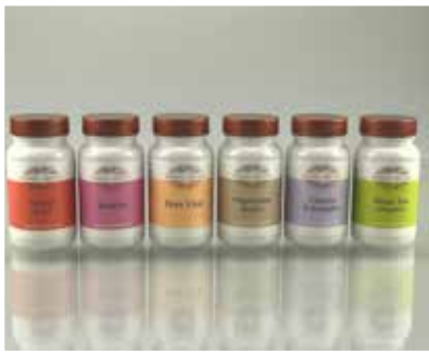
A9 Omnipack Baerbel Drexel