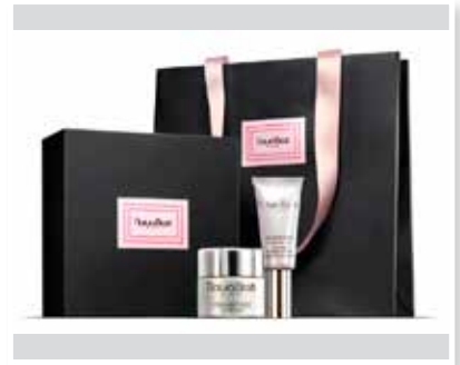
A9 IPE Natura Bissé