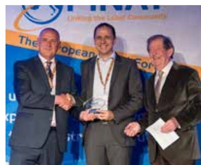
Marzek Group B