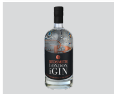
A2 Royston Redsmith Gin