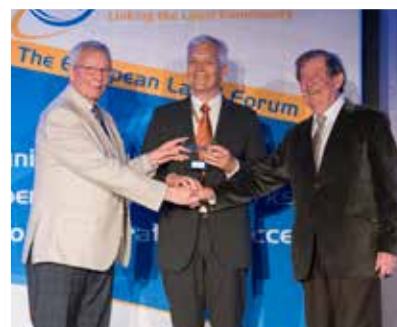
EtikettenCarini Group E