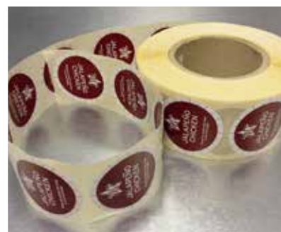
D1 Source Labels Utroque