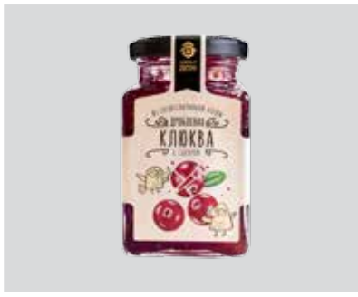
A4 Flex-n-Roll Droblionaya Klyukva