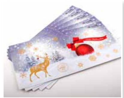
A14 Marzek Weihnachtskarte