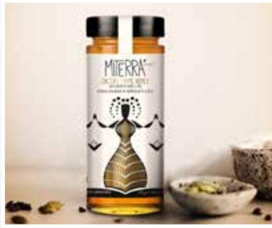
A4 Cabas Minoan Gaia Mitera Cretan Thyme Honey