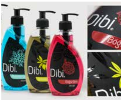
A15 Çiftsan Dibi Liquid Soap