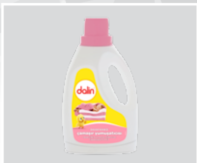
B1 DGS Dalin Bahar Ninnisi