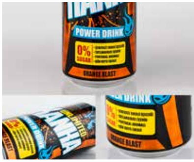
A3 Çiftsan KankaPowerDrink