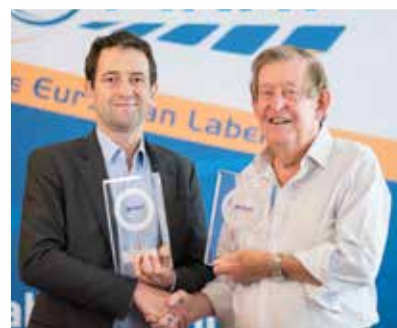
Stratus Packaging A4-A7