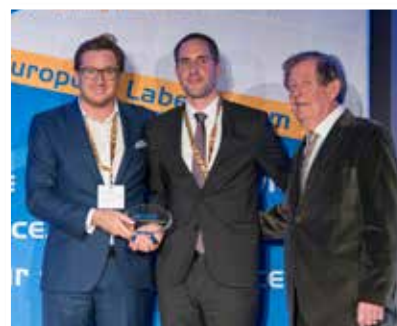
Schreiner Group D