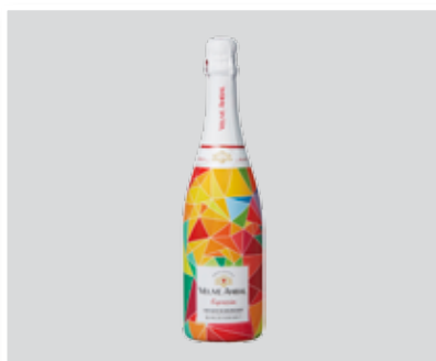
C3 Stratus Manchon Veuve Ambal Kal ido