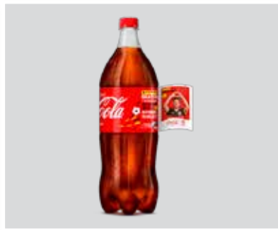
A13 Source Coca-Cola