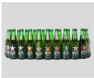
B6 Constantia Spear Heineken winners