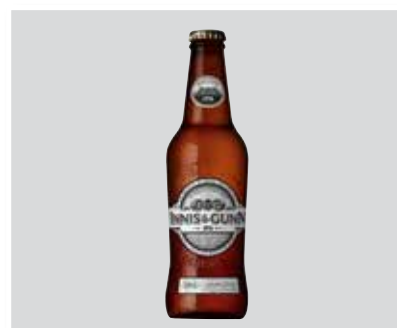
B4 Constantia-Spear Innis&Gunn