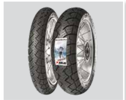
B1 Dgs Anlas Winter Grip Plus